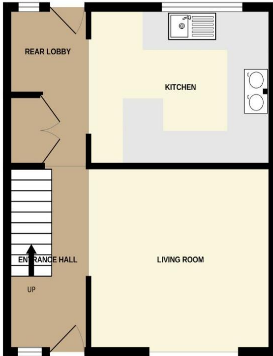
GROUND FLOOR 406 sq.ft. (37.7 sq.m.) approx.