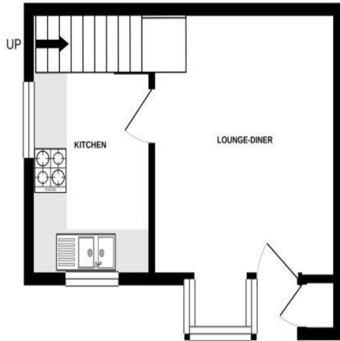
GROUND FLOOR 242 sq.ft. (22.5 sq.m.) approx.